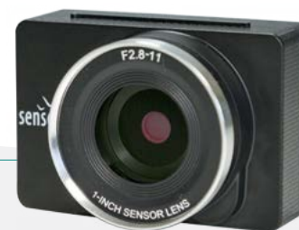
senseFly S.O.D.A. Sensor Optimised for Drone Applications

The senseFly S.O.D.A. is the first camera to be designed for professional drone photogrammetry. It captures amazingly sharp aerial RGB images, across a range of light conditions, allowing you to produce detailed, vivid orthomosaics and highly precise digital surface models.